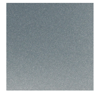
Canon 2525 YW279F