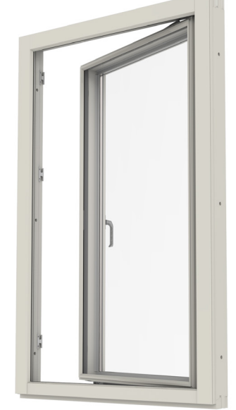
Airing position (Kipp)